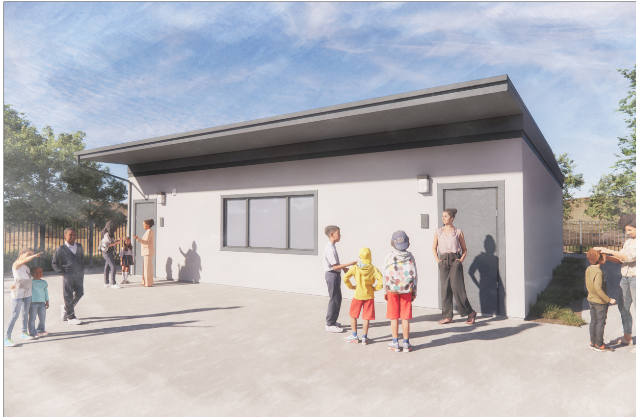
PERSPECTIVE (FINISHES SUBJECT TO CHANGE)